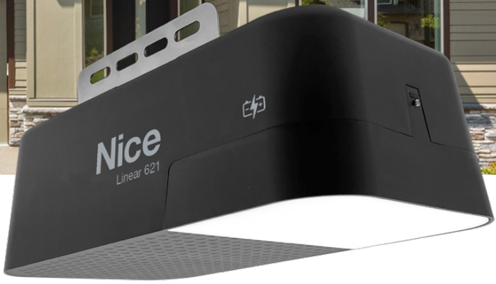
Operates residential sectional doors up to 8 ft tall & 350 lbs.